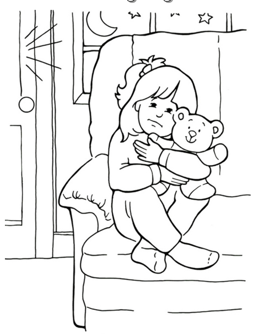
God is with me when I am afraid.

From Thru-the-Bible Coloring Pages for Ages 4-8. © Standard Publishing. Used by permission. Reproducible Coloring Books may be purchased from Standard Publishing, www.standardpub.com, 1-800-543-1301.